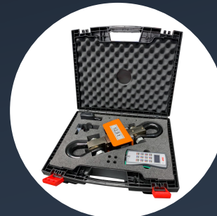
Practical carrying case