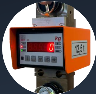
Robust protective cover & LED display