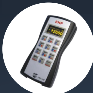
DRC433 radio remote control incl. display