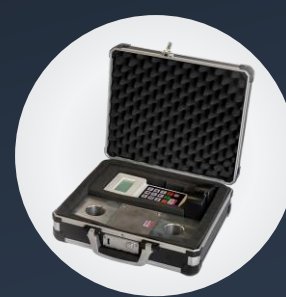
Handy transport case