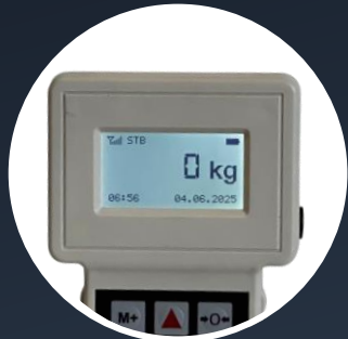
Hugh display at remote control