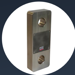
Robust load cell